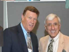
Davis College faculty celebrating 150 years