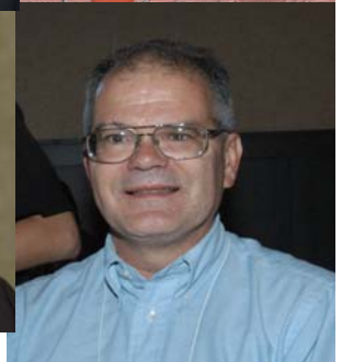
Ace Photographer Lynn Wells