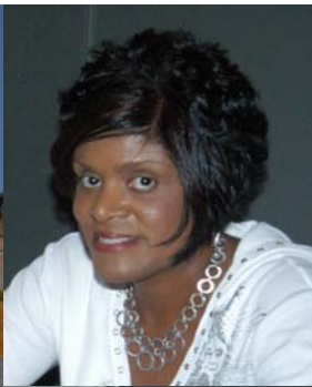
Lots of laughter for The Around the Bend Players