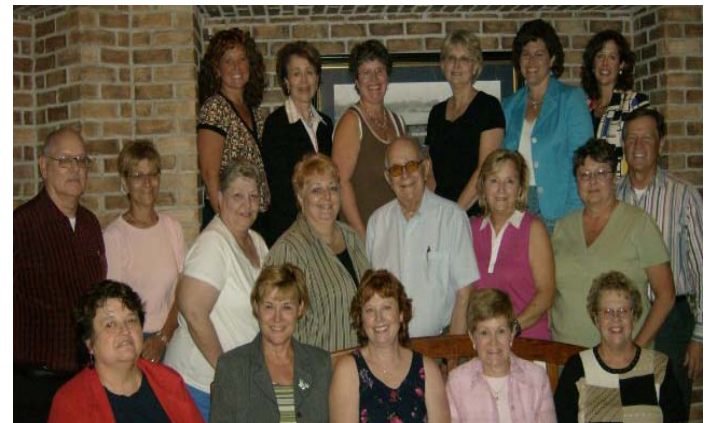
M.A.S.H. Unit 4080